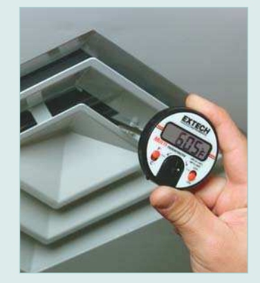
Stem thermometer ideal for measuring temperature in HVAC applications such as air ducts, vents, and heaters.